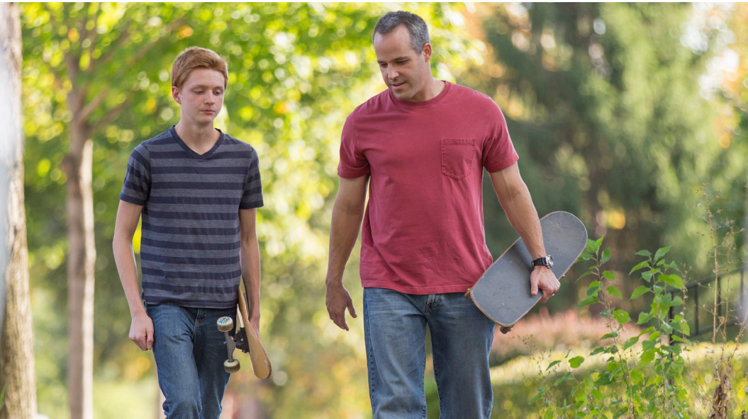
Stock photos used

Live Vape Free SM is a teen and adult solution to help solve the vaping epidemic. The program is grounded in more than 35 years of physical, psychological and behavioral health science from Optum, a leading health services and innovation company dedicated to helping make the health system work better for everyone.